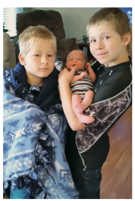
Southwest Minnesota Welcome Blanket Recipients