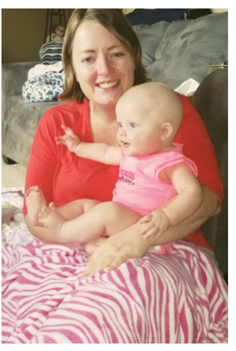
Northwest Minnesota Welcome Blanket Recipient