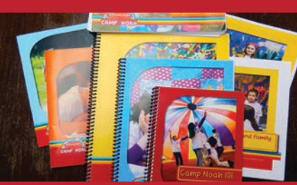
Camp Noah's beautifully written, designed and printed curriculum!