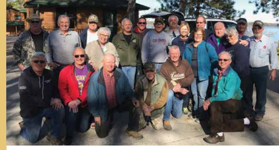
ZION LUTHERAN CHURCH OF AMOR Zion Lutheran Church of Amor volunteers share their time and talents to help prepare the camp for each summer.

There are many ways volunteers support Camp Knutson: preparing camp for summer, keeping the grounds neat, beading, airport support, serving at tailgate dinners, organizing fundraisers, and so, so much more. But the heartbeat of volunteers at Camp is the care and nurturing each volunteer brings to their work. It is the kind word, the listening ear, the smiles and laughter, the warm hug, the deep desire to make a positive impact in the life of another human being. And that is a priceless treasure!