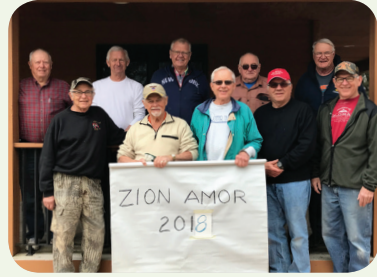
ZION LUTHERAN CHURCH OF AMOR Zion Lutheran Church of Amor volunteers share with us their time and talents to help prepare the camp for each summer.