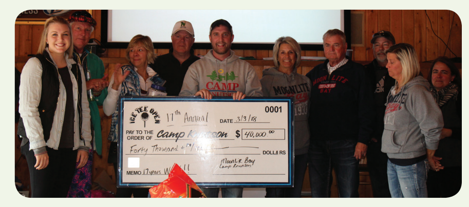
ICE TEE OPEN Presented by Moonlite Bay Family Restaurant & Bar

GOLF SCRAMBLE A "Round for the Kids" Golf Scramble at Whitefish Golf Course